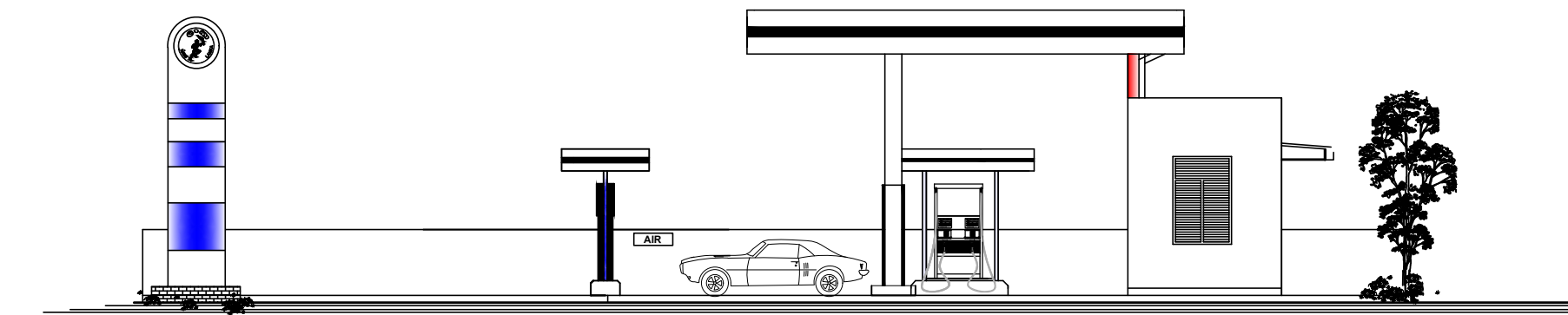
SIDE ELEVATION FROM - B